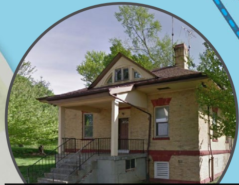
3. INTERPRETATION AT LOCK CARETAKER'S BUILDING