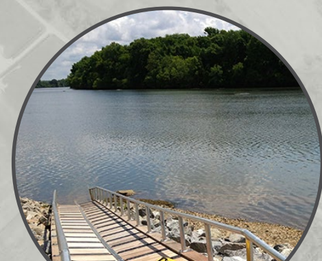
2. ACCESSIBLE CANOE/KAYAK LAUNCH