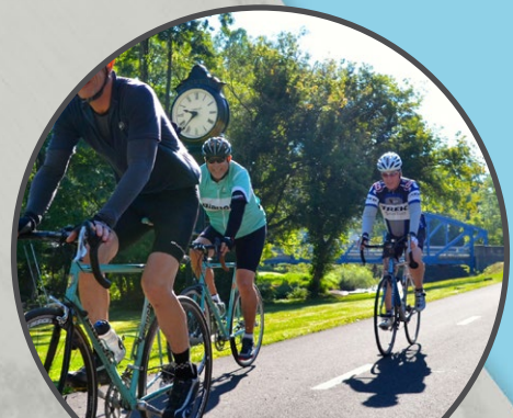
FUTURE OHIO RIVER TRAIL